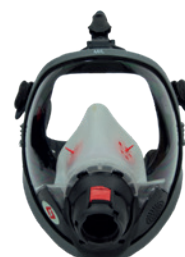
3M™ Scott™ Vision AMS facepiece