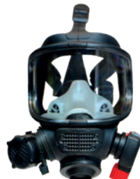
3M™ Scott™ Promask facepiece