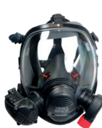
3M™ Scott™ Vision 3 facepiece