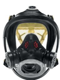
3M™ Scott™ AV-3000 HT facepiece